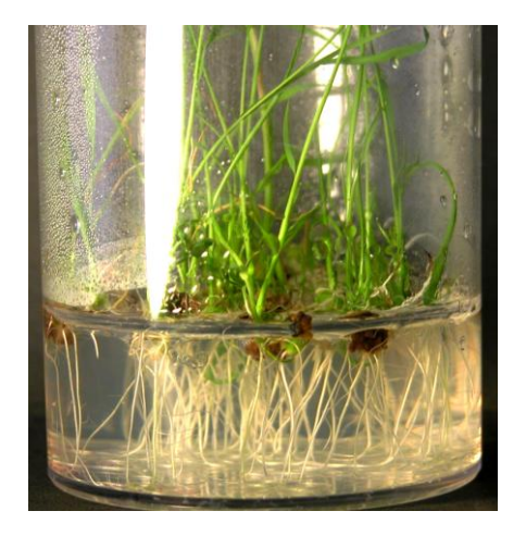
Figure 2: Roots are fully developed prior to moving plants to pots of soil

Once roots are well formed the plants are ready to be transferred into soil.