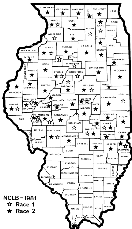
Fig. 2. Distribution of races 1 and 2 of Exserohilum turcicum , cause of northern corn leaf blight (NCLB), in Illinois in 1981.

and 2. Race 2 was found in Carroll, Howard, and Jasper counties every year and in Marshall, Wayne, and Clinton counties in 2 yr. Each year, race 1 was found in only three counties. In all, race 2 was confirmed from 24 counties in Indiana from 1979 through 1981.