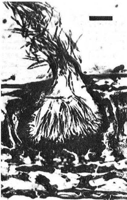
Fig. 2. Pycnidium of Septoria cf. molleriana from a leaf spot on Canavalia kauensis . (Scale bar represents 20 \mu m.)

naturally infected leaves in the field (0.5–1.5; mean: 0.9 mm), but were otherwise comparable. Conidia similar to those with which the leaves had been inoculated were readily obtained from