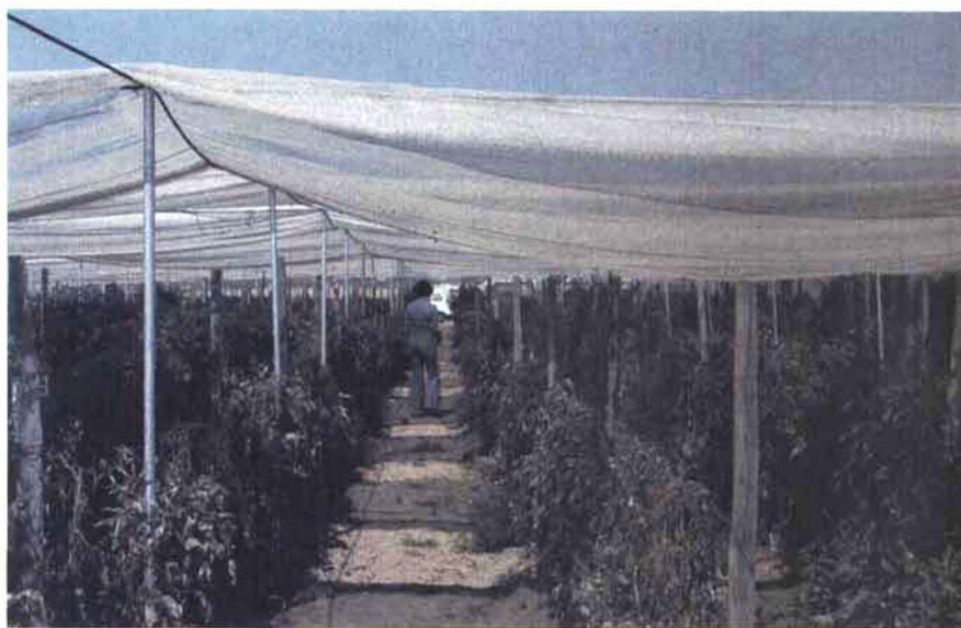
Fig. 3. Tomato plants grown under a canopy of plastic screens.

Conditions in the Negev are neither more nor less advantageous for Stemphylium blight than are conditions in more humid areas. The dew periods (up to 14 hours) are too short for completion of infection and sporulation. The pathogen, however, is able to complete these processes during several dew periods interrupted by dry periods (2,3).