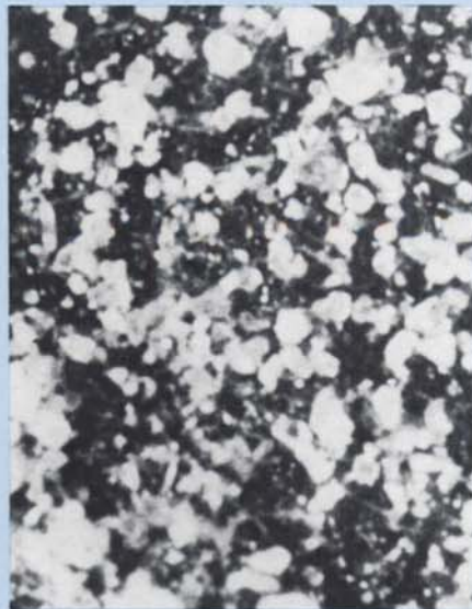
Fig. 1. (Left) Tomato leaf after a strong sandstorm in the Negev. (Right) Close-up of leaf.

To some people in temperate zones where plant diseases are established, the lack of abundant rainfall in hot, arid zones suggests that foliar plant diseases are also lacking. This impression is only partly true in completely arid sites and is erroneous in areas with some form of moisture—dew, fog, or rain—during specific seasons. In some arid areas, disease pressure results from irrigating and from large plantings of high-yield but susceptible cultivars. This happens in temperate zones, too, but is more striking in arid zones where diseases have been scarce.