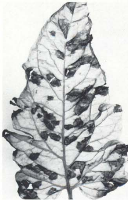
Fig. 2. Multiple early blight lesions incited by Alternaria solani on a tomato leaf about 10 days after a sandstorm.

early blight or Stemphylium blight lesions are found occasionally. In several instances, Phytophthora late blight,