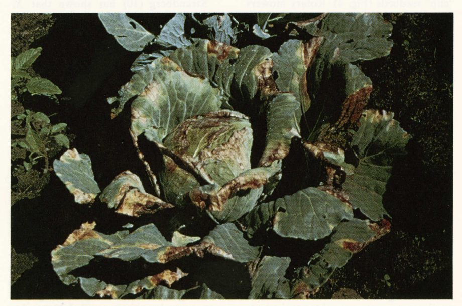
Fig. 1. Characteristic symptoms of black rot on cabbage.

A number of practices associated with transplant bed production of crucifers are particularly hazardous with respect to black rot. Some growers traditionally grow rows of radishes, turnips, or mustard among the beds of cauliflower or cabbage seedlings as "indicators" of whether the soil nutrient balance is satisfactory. When the quick-growing indicator rows begin to show deficiencies, side dressings of fertilizer are applied to the seedlings. But these indicator rows