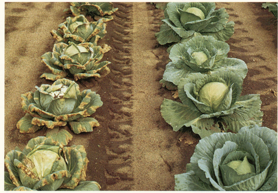
Fig. 7. Row of cabbage on the right is a resistant Badger Inbred derived from the Japanese cultivar Early Fuji.

resistant X. campestris, while incorporating existing forms into other brassica crops, is pressing. Resistance is particularly needed for crops grown in the humid tropics and subtropics. Indeed, the new sources of resistance for breeding programs must be seeded in such regions, where black rot is endemic.