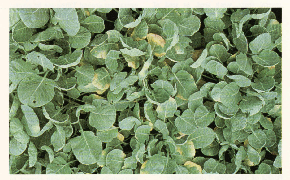
Fig. 3. Black rot infestation in a transplant bed. The infection level rose from 0.5% initially to 65% after 3 weeks.

occasionally carry seedborne X. campestris!