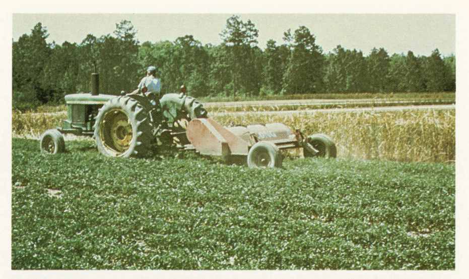
Fig. 4. Tractor-driven mower "clipping" tomato transplants in a seedbed. Such a practice before crucifer plants are lifted is particularly hazardous in spreading such bacterial diseases as Xanthomonas campestris.

NCR-100's activities are resulting in a growing list of reports and publications representing collaborative research among members (3,4,8). Research has focused primarily on identifying gaps in understanding the epidemiology of black rot and blackleg and in developing improved procedures to detect and control seedborne infection. The development and implementation of crucifer seed lot assays were among the first activities of the committee (6,8). Through assays of seed lots produced or purchased for sale in the United States, a