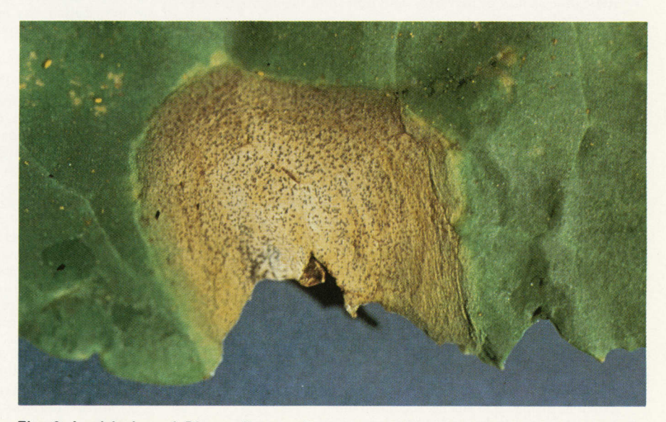
Fig. 6. Leaf lesion of Phoma lingam , the cause of blackleg, showing characteristic pycnidia.