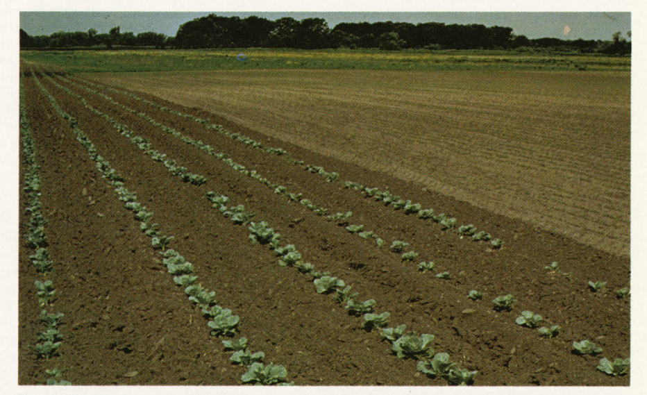
Fig. 5. Of this transplanted early crop of cabbage (left) growing adjacent to a large seedbed, 70% were systemically infected with X. campestris . Subsequent heavy rains spread infection into the seedbed.