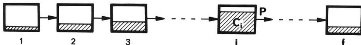
Fig. 2. The box model which was developed to describe the time-rate of germination of Alternaria solani spores. The spores pass through f steps on their way to germination. The count C_i of spores in each step is represented by the level of shading and changes as the fraction P per hour progresses.

and P can be eliminated from equation 4 to obtain