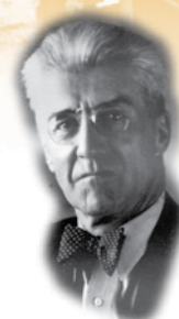
President 1945 H. B. Humphrey

1944 First root-knot resistance in tomato (hybrid) derived from a wild tomato species ( Lycopersicon peruvianum )