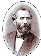
Anton de Bary (1831-1888)