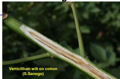
Verticillium wilt on cotton (S.Sanogo)