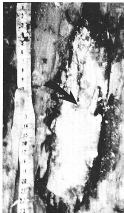
Fig. 2. Vertical, elliptical canker development on the bole of a 25-yr-old Monterey pine tree 19 mo after inoculation with Fusarium subglutinans . Tree diameter at the point of inoculation (arrow) is approximately 40 cm. Heavy resinosis at the canker center and resin-soaked wood at the canker margin are apparent.

a Each number is the mean of two inoculations per tree. Rating is on a scale of 0-5, where 0 = healthy and 5 = girdling lesion with most (> 75%) of the needles distal to the inoculation point necrotic. All uninoculated controls remained uninfected.