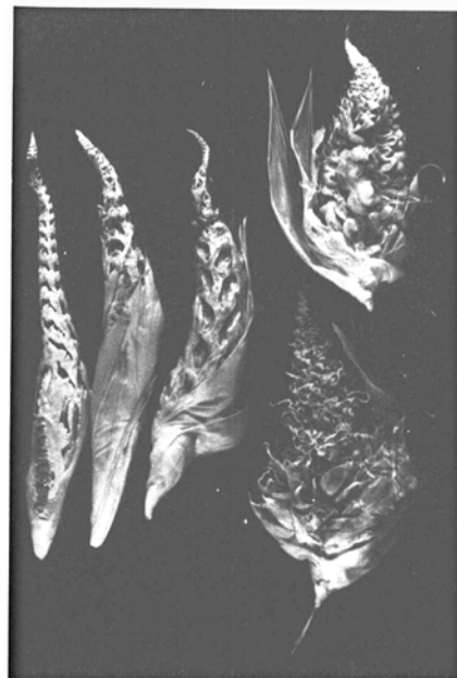
Fig. 3. Ear galls induced in B73 × Mo17 dent corn plants in which a mixed suspension of sporidia of isolates of Ustilago maydis was injected between the leaf sheath and stalk at the sixth, seventh, and eighth nodes below the top of the plant at the time of tassel emergence from the leaf whorl. Similar ear galls formed on inoculated sweet corn plants.