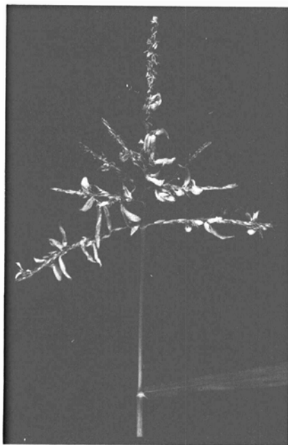
Fig. 2. Tassel galls induced in a B73 × Mo17 dent corn plant injected in the leaf whorl with a mixed suspension of sporidia of isolates of Ustilago maydis 3 days before tassel emergence. Similar tassel galls formed on inoculated sweet corn plants.

For the 25 hybrids grown in soil beds, the number of ear galls per inoculated plant was significantly correlated with the number of stalk and axillary bud galls per plant ( r = 0.465 , P < 0.05 ). This was also true for these 25 hybrids grown in pots ( r = 0.508 , P < 0.01 ). There was a statistically significant negative correlation between smut incidence and number of healthy ears per plant ( r = -0.484 , P < 0.05 ). Injection of tap water between the leaf sheath and stalk had no measurable effect on ear development. For the 14 hybrids that had both inoculated and uninoculated treatments, the mean smut incidence was 70% in