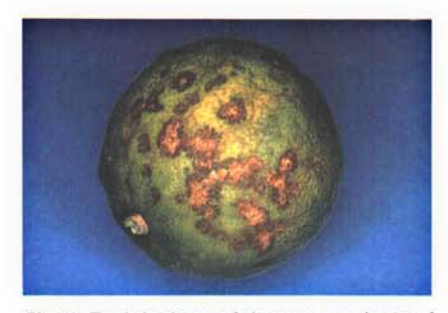
Fig. 3. Fruit lesions of the nursery form of citrus canker on Poncirus trifollata cv. Flying Dragon are sunken, necrotic, and surrounded by water-soaking and chlorosis.