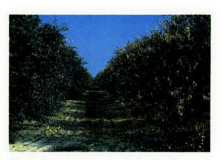
Fig. 5. (Right) Trees treated with diquat at 300 ppm and (left) untreated trees in a Florida citrus grove near a nursery infested with Xanthomonas campestris pv. citrl.

relatively resistant to other types of canker (6), was reported twice where other hosts were also infected. Sour orange ( C. aurantium L.) has been found in infested nurseries but has not been naturally infected, even though it is experimentally susceptible. Mexican lime and Persian lime ( C. aurantifolia hybrid) have not been in the inventory of infested nurseries but are experimentally susceptible. As with other citrus cankers, Mexican lime is more susceptible than Persian lime to the nursery type of citrus canker.