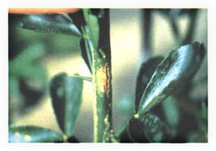
Fig. 2. Stem lesion of the nursery form of citrus canker on citrumelo ( Poncirus trifollata \times Citrus paradisi cv. Swingle) is raised, brown, and corky with a greasy-appearing margin.