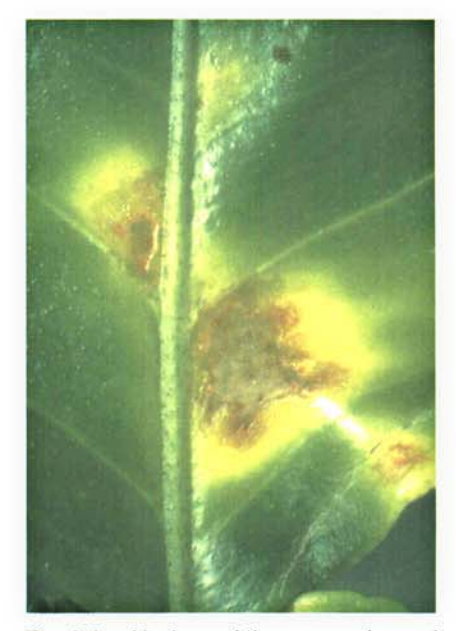
Fig. 1. Leaf lesions of the nursery form of citrus canker on grapefruit ( Citrus paradisi ) are sunken, water-soaked, and surrounded by chlorosis.

of infestation was unexplained. Most of this citrumelo involvement occurred in 1985 and by year's end had a significant impact on the use of this rootstock by nurserymen. Grapefruit, the second most frequently infected host and one of the parents of citrumelo, was affected in seven sites. Mandarin orange (C. reticulata Blanco), considered to be