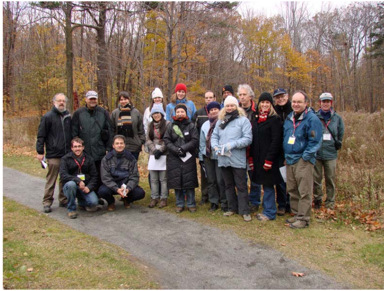
NED Forest Pathology Tour participants