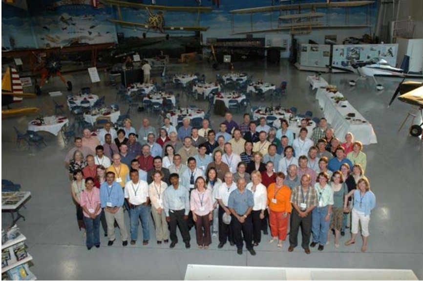
Attendees of the 2006 North Central Division Meeting held in Fargo, ND.