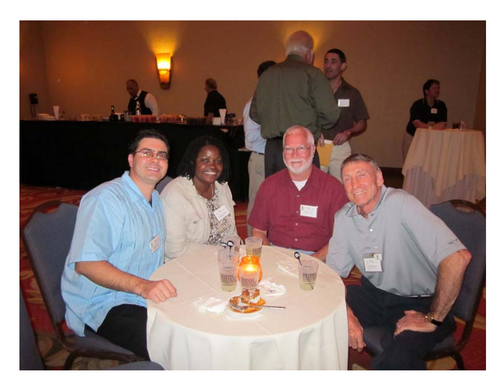
Division attendees enjoyed the science and the camaraderie.