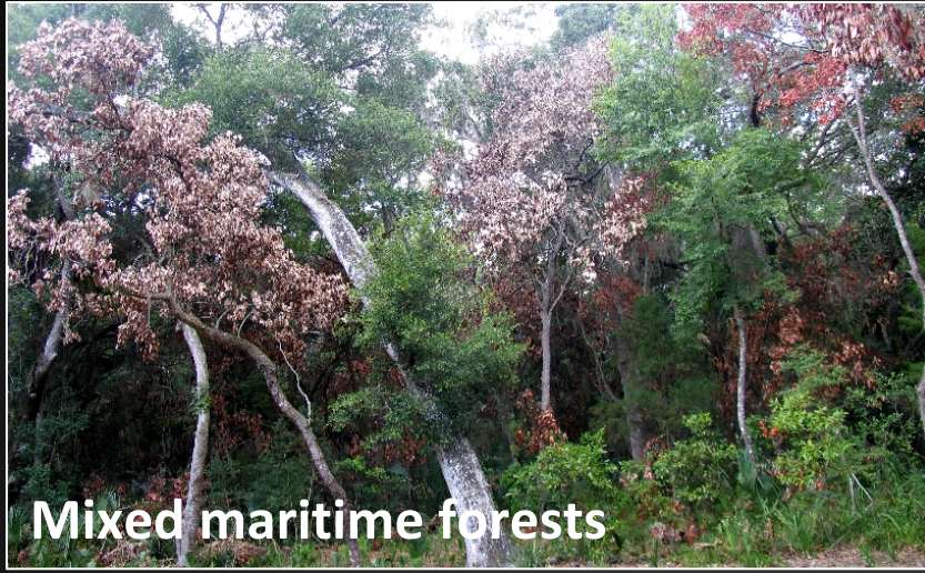
Mixed maritime forests